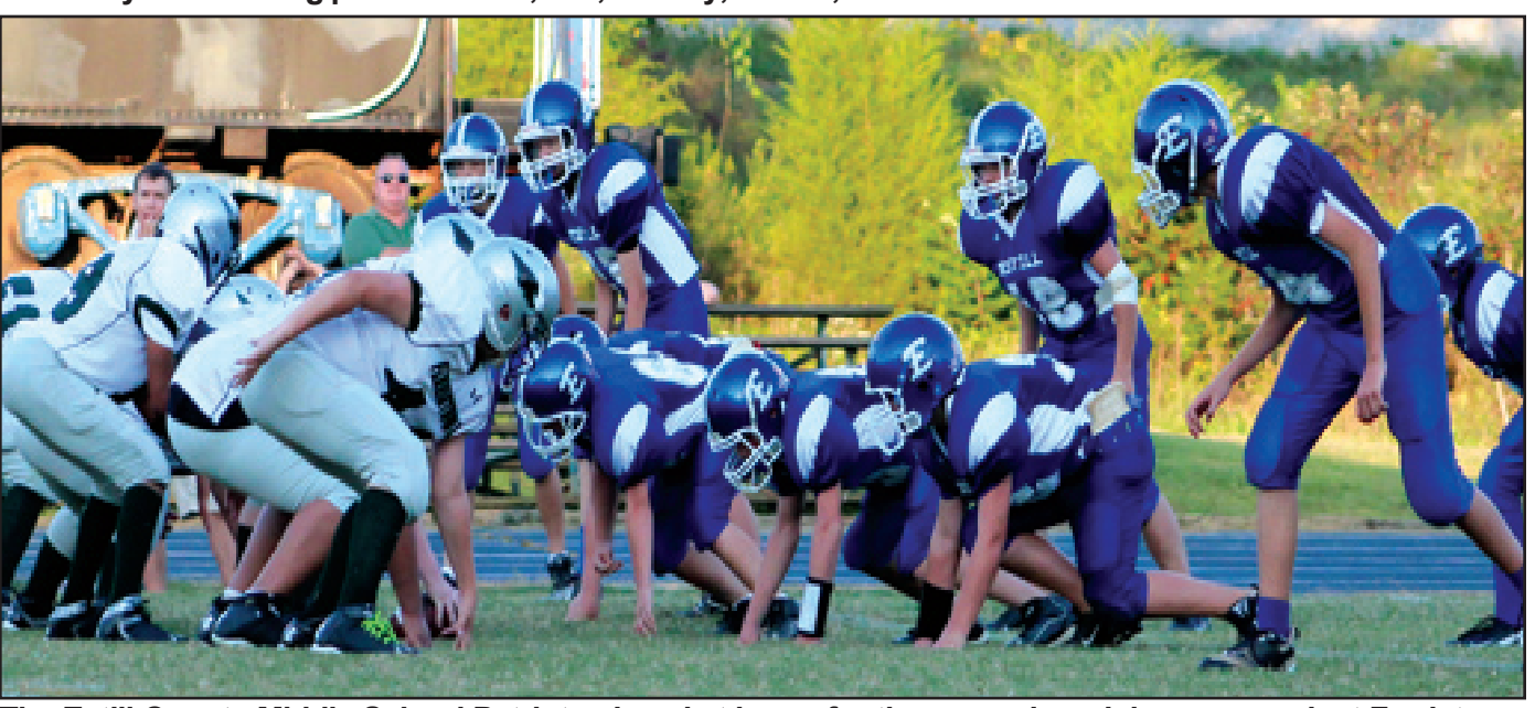
The Estill County Middle School Patriots played at home for the second week in a row against Farristown Middle School from Madison County. The Patriots played a good game against Farristown but came up short with a final score of Farristown - 24 and Patriots - 12.