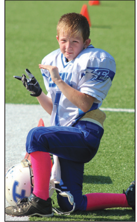
head State University.