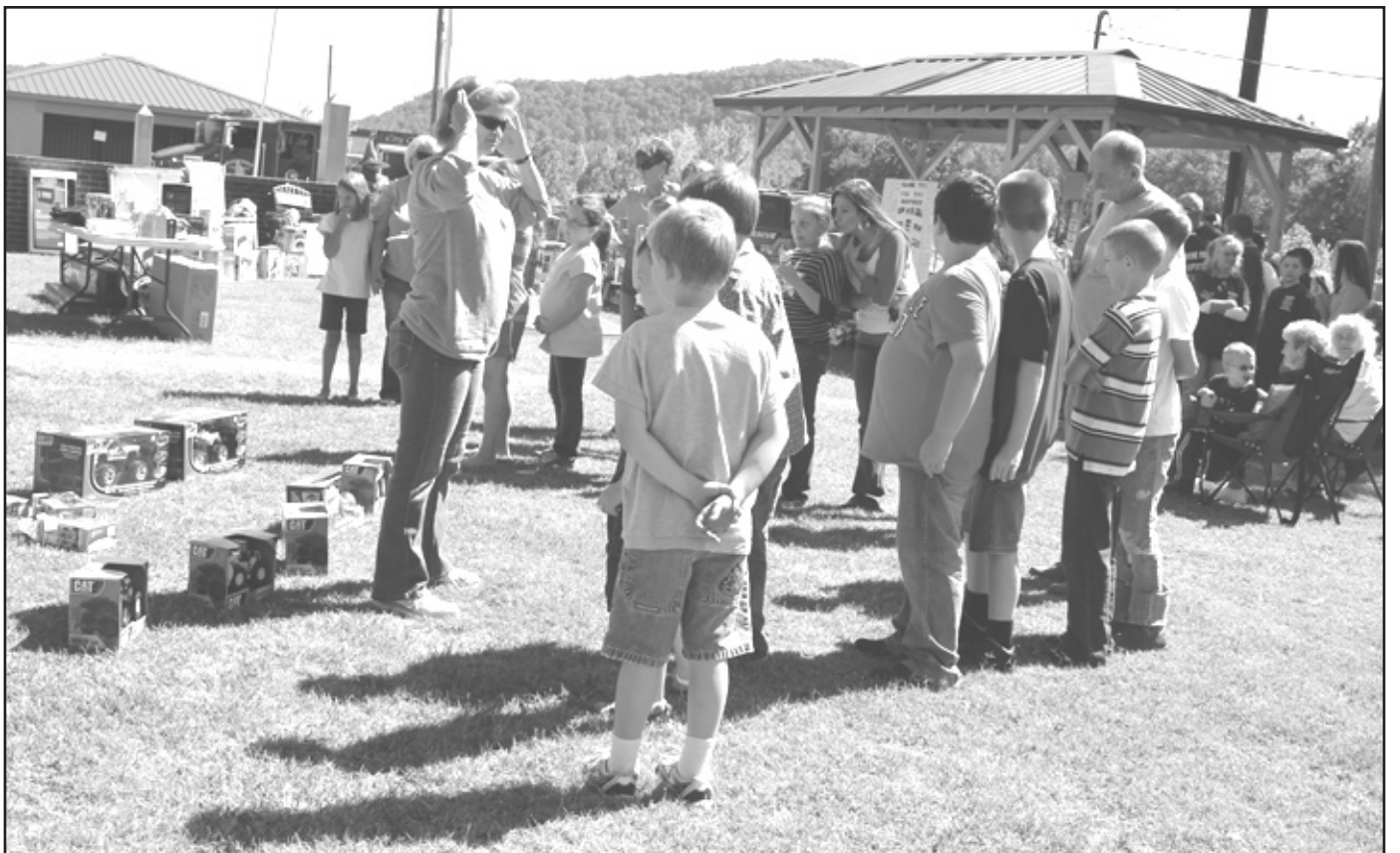
Children lined up until they were given the go-ahead to make a mad dash for toys on Saturday afternoon during the Volunteer picnic.

Just before press deadline, the school board faxed the agenda for Thursday's regular board meeting. One item listed was to approve delaying the billing of the recallable nickle (6.3) tax on real estate and property until 2014. The school board meeting starts at 6 p.m. in the board room (upstairs) in the Central Office Building on Main Street. All citizens are welcome to attend these meetings.