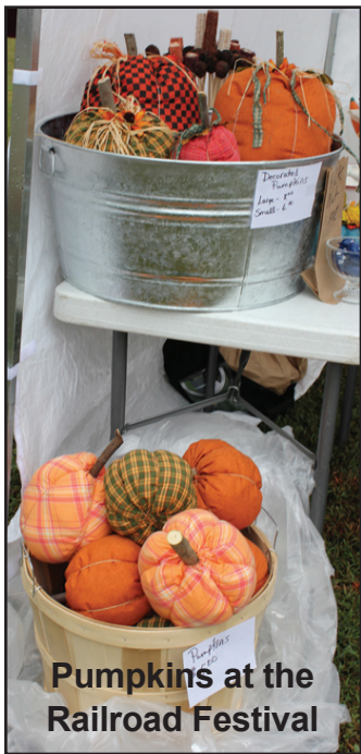
Pumpkins at the Railroad Festival