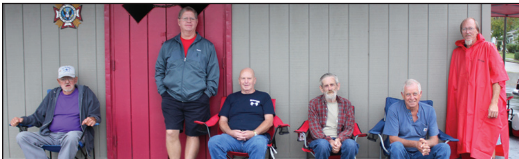
Rain forced car show exhibitors to take shelter at the Railroad Festival. Awards from that festival will be presented during the last car show of the season.