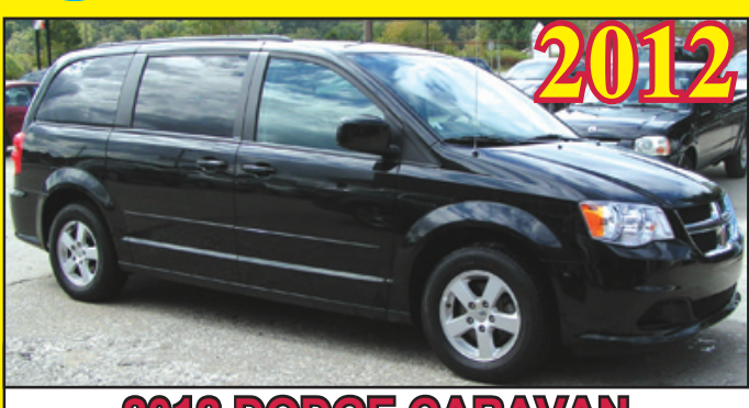
2012 DODGE CARAVAN STOW AND GO SEATS! LOADED WITH OPTIONS! LOW MILES! LIKE NEW! FACTORY WARRANTY!