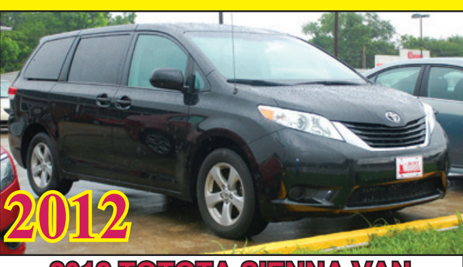
AUTOMATIC, AIR, LOADED! LIKE NEW! FACTORY WARRANTY! FINANCING AVAILABLE!

We work with Community Trust, Chase and BB&T Banks; But we'll work with any bank or credit union to get you the best rate on a loan!