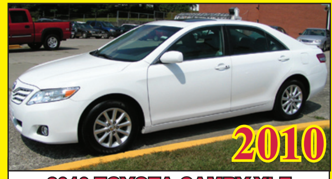
XLE EDITION WITH LEATHER, MOON ROOF, V-6! LOADED! ONLY 16K MILES! FAC/WAR! FIN/AVAIL!