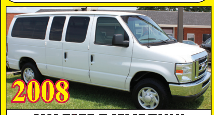
2008 FORD E-350 XLT VAN SUPER DUTY, 13-PAS. XLT VAN, DUAL AIR & HEAT! BEEN WELL MAINTAINED! FINANCING AVAILABLE!