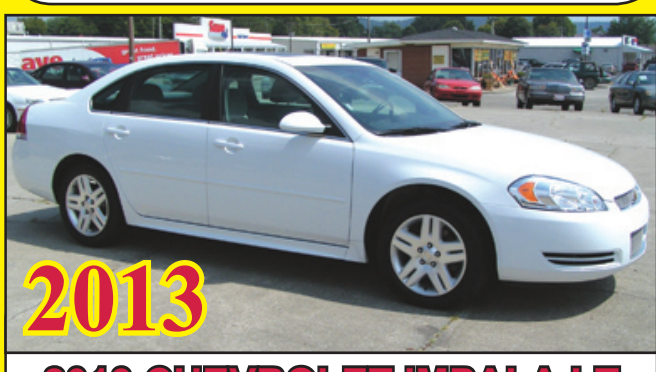
2013 CHEVROLET IMPALA 4-DOOR, V-6, MOON ROOF! LOADED! ONLY 31K MILES! "BEST BUY TODAY!" FINANCING AVAILABLE!