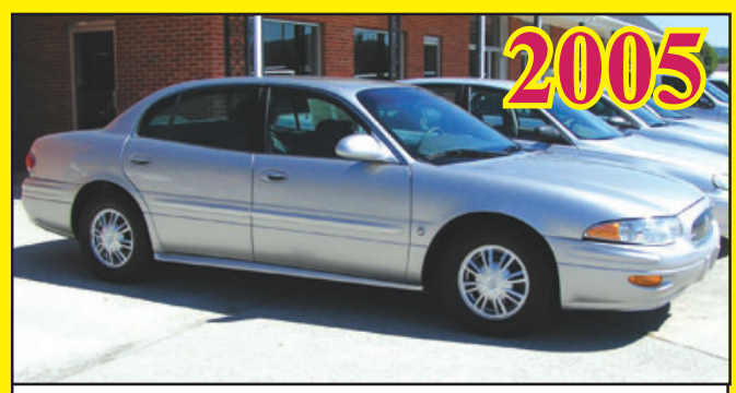
BUICK LESABRE 3.8, V-6, 4-DOOR! LOADED! NICE CAR! WE HAVE FINANCING!