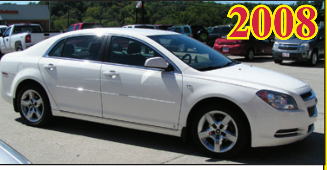
2008 CHEVROLET MALIBU LT 4-DOOR, LOADED! SHARP! READY TO GO! FINANCING IS AVAILABLE!