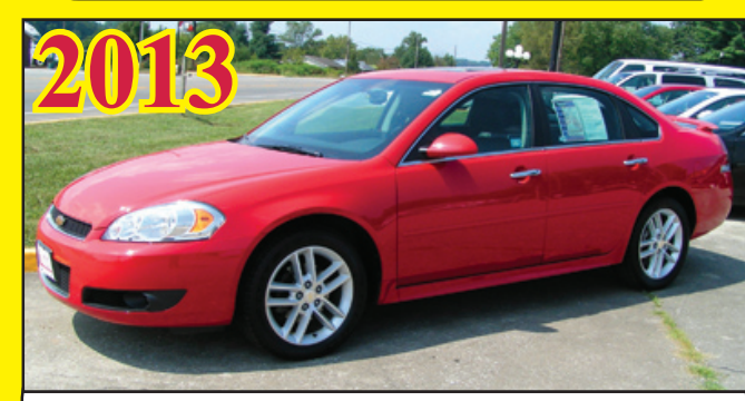
2013 CHEVROLET IMPALA LTZ LEATHER! MOON ROOF! ONLY 26,000 MILES! 5-YEAR/100,000 MILES GM WARRANTY!

We work with Community Trust, Chase and BB&T Banks; But we'll work with any bank or credit union to get you the best rate on a loan!