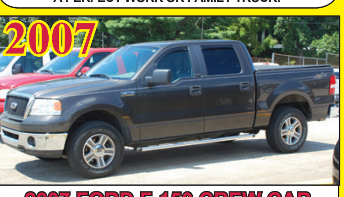
2007 FORD F-150 CREW CAB 4-DOOR, 4X4, V/8, AUTOMATIC, LEATHER! LOADED, LOCAL TRADE!