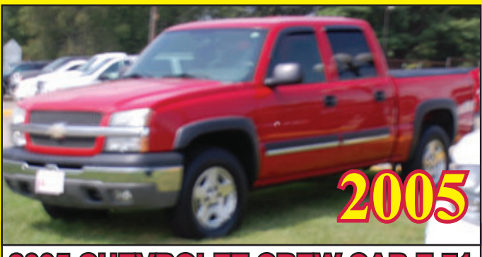
4-DOOR WITH Z71 PACKAGE! A PERFECT WORK OR FAMILY TRUCK!