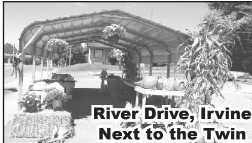
River Drive, Irvine Next to the Twin