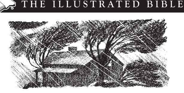
The Lord has His way in the whirlwind and in the storm, and the clouds are the dust of His feet. NAHUM 1:3