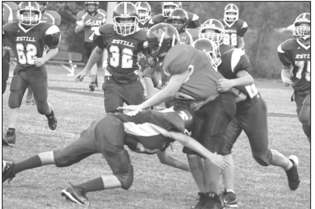
The Estill County Middle School Patriots hosted Foley Middle School on October 2, 2013 at the Hoover Niece Field. The Patriots were on fire during the game and beat Foley 42-8.