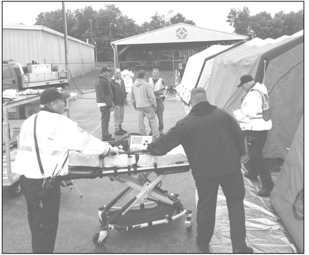
First responders set up decontamination sites at the Estill County Fairgrounds where people can be treated for possible chemical exposure during a preparedness exercise on Wednesday, September 18, 2013.

For more information about CSEPP please contact the Estill County EMA/CSEPP office at 723-6533, or visit us on the web www.estillcountyema.com , find us on Facebook and Twitter as well.