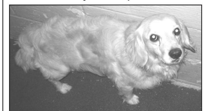
CTL #1559 Cocker Spaniel Male - 4 Years Old "Ready For Adoption"

Everyone can see what we have in the Shelter by going to Facebook and looking at our new FB Page, "The Estill County Animal Shelter". The Estill Co. Animal Shelter 50 Ginter Road, Ravenna (606) 723-3587 Like Us On Facebook!