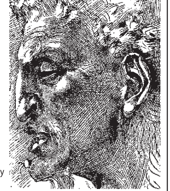
Head of Satan by Michelangelo, 16th century

And the Lord said to Satan, "From where do you come?" So Satan answered the Lord and said, "From going to and fro on the earth, and from walking back and forth on it." — JOB 1:7