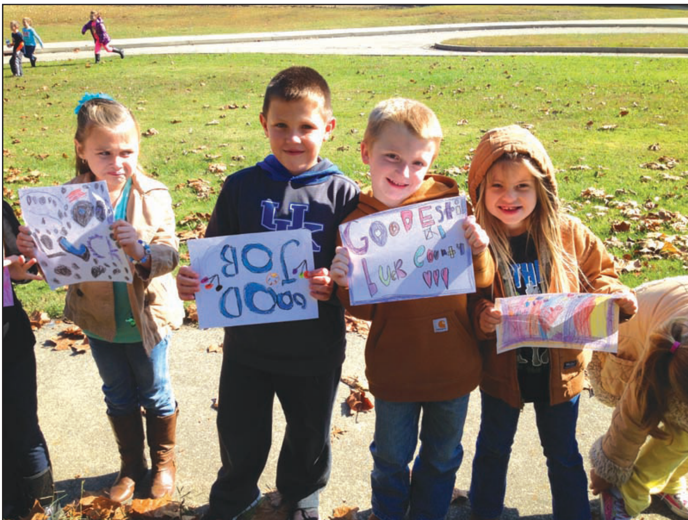
Students at Estill Springs Elementary lined up on the sidewalk with signs they had made to support the Marching Engineers as they left for state competition on Friday afternoon. The Estill County Marching Engineers will present an Encore Performance this Saturday, Nov. 2 at 3 p.m. at the high school football field. This is the band and band booster's way of saying thanks to the community. Everyone is invited to this performance.