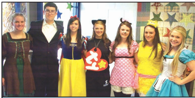
Unite To Read – Page 2