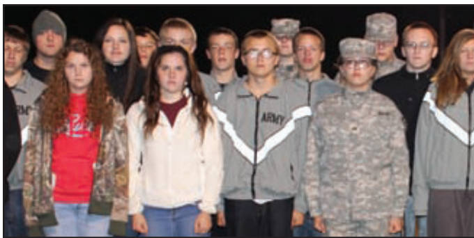
Sports Teams Recognized – Page 17