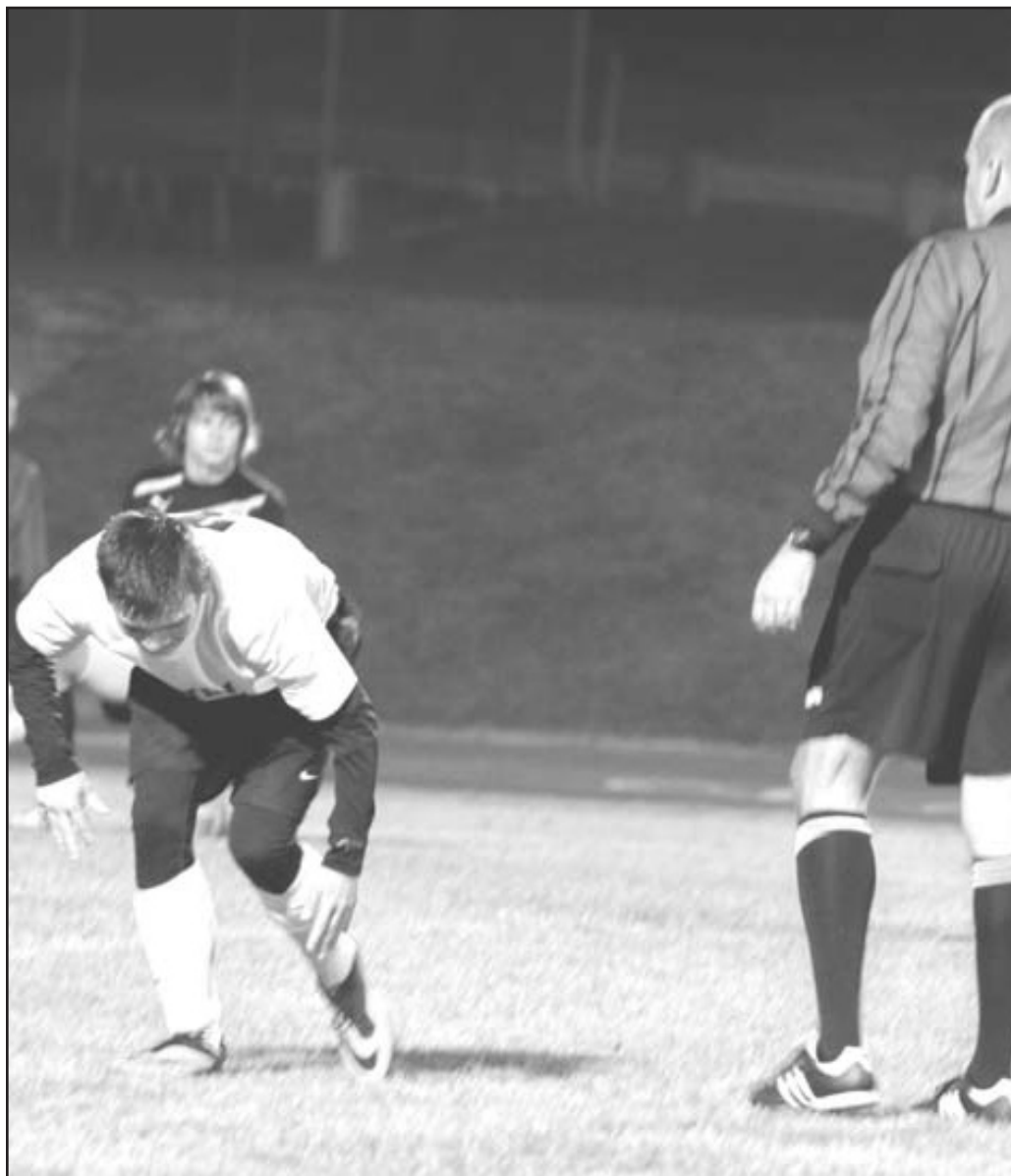
Monday night's game against Johnson Central proved to be a battle for both teams. Players for Estill County as well as Johnson Central sustained minor injuries during the game as they fought for their place in the next round of championship games.