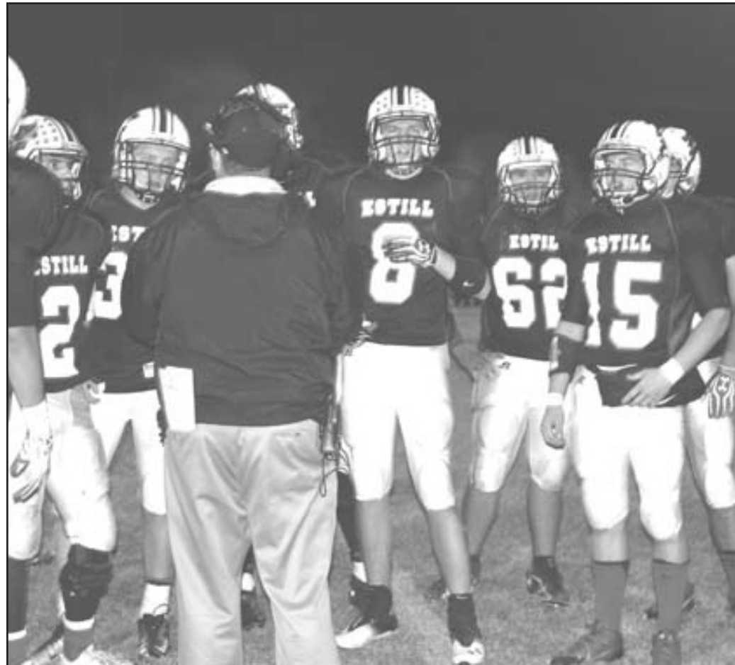
The Estill County Engineers football team took a timeout on Friday night at Hoover Niece Field but could not come up with a way to handle the Garrard County Golden Lions. Estill lost 34-7 but will still be in the playoffs.