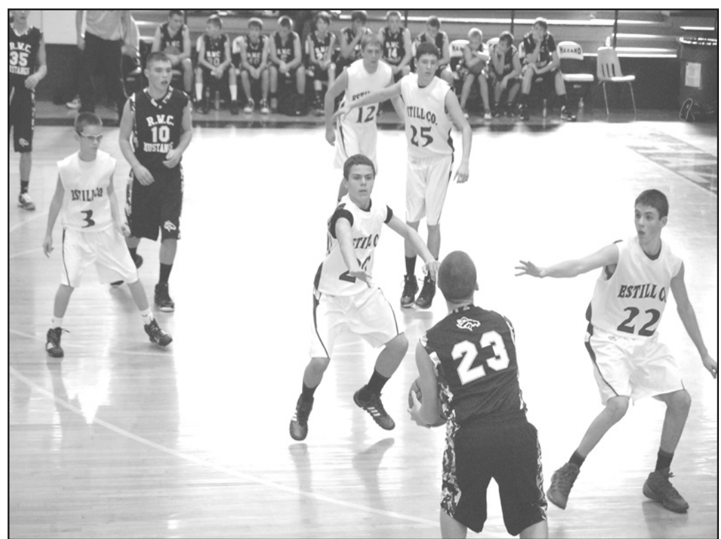
Estill Middle School Patriots 8th Grade action

The Patriots open conference play this week on Thursday playing at Rockcastle, and will host the 56th Middle School District Tournament on Saturday, November 23. Tournament games begin at 10 am.