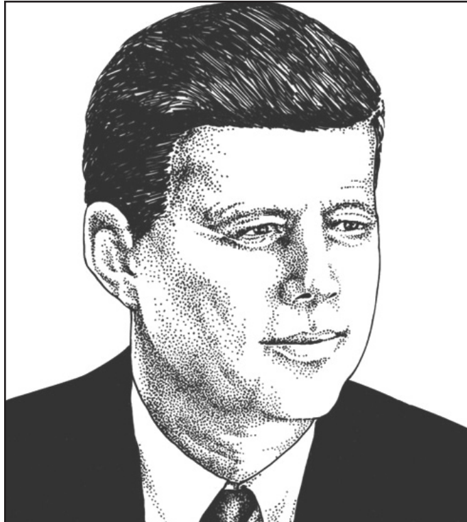
John F. Kennedy May 19, 1917 to November 22, 1963 35th U.S. President

T1492 - Nov. 20, 2013 Visit uat: SowerMinistries.org