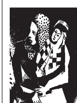
Detail of A Group of People by Marc Chagall, 1914

...from infancy you have known the holy Scriptures, which are able to make you wise for salvation through faith in Christ Jesus.