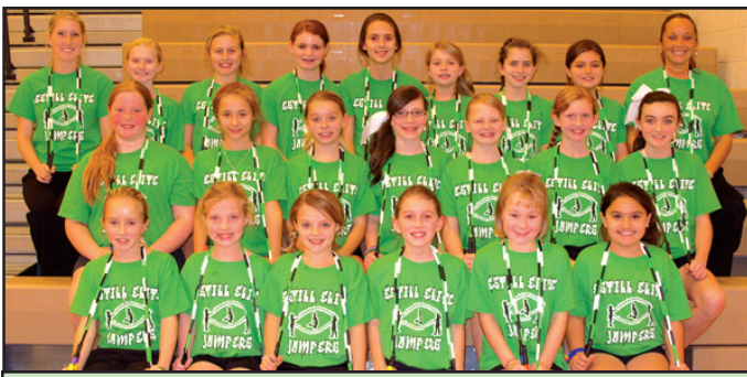
Estill Elite Jumpers – Pages 18 & 19