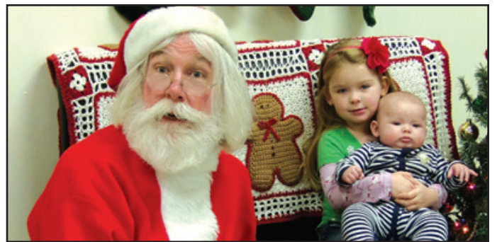
Breakfast With Santa – Page 2, 19