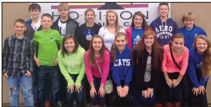
Estill Student Councils – Page 19