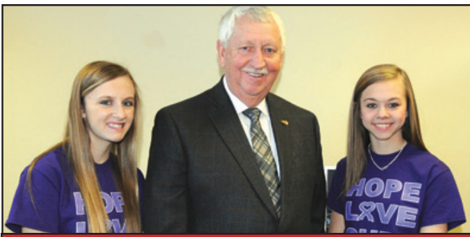
Alzheimer's Awareness – Page 2