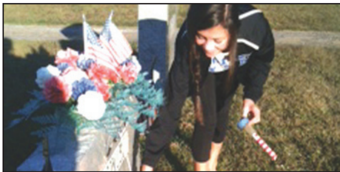
Caring For Cemeteries – Page 14