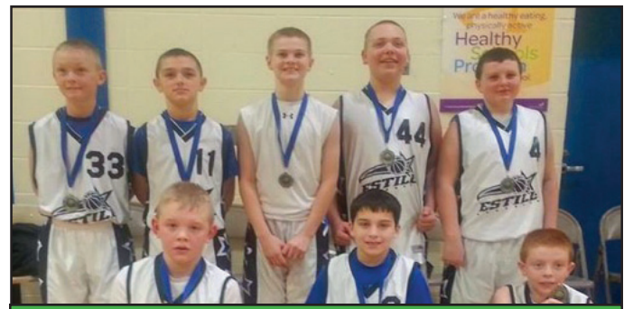
AAU Basketball – Page 15