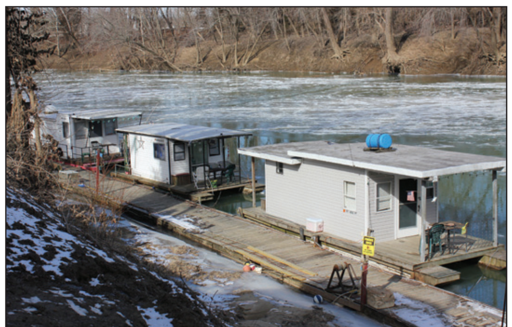
The Kentucky River did not freeze over entirely during the recent cold, but there are a lot of chunks of ice (white) floating near the boat dock.