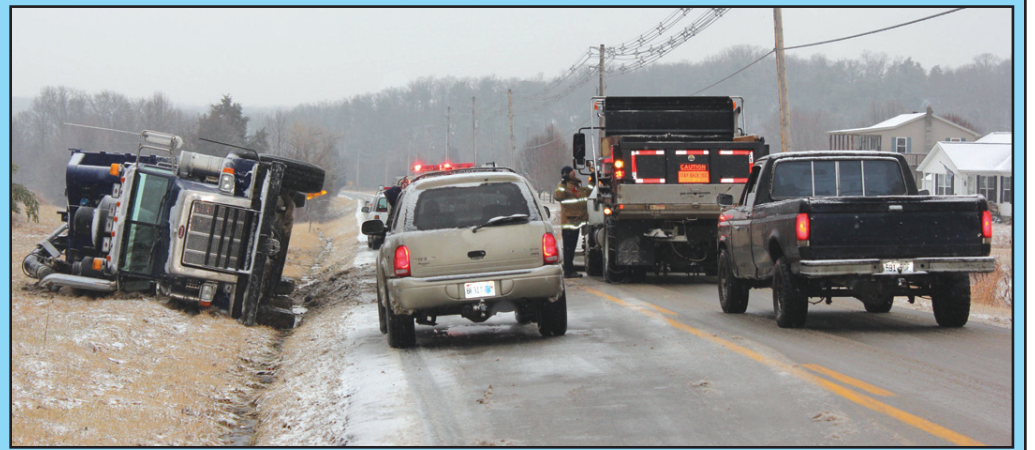
Ice first covered Estill County roads on Monday morning before just over an inch of snow fell. This accident occurred right before the state highway could get the Spout Springs Road salted. The driver of the tractor-trailer was not injured.