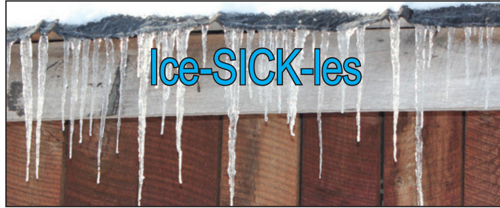
As snow melted off roofs on Monday, the water quickly formed icicles in the cold temperatures.

Her preliminary hearing is set for Feb. 12. Bond has been set at $10,000 cash.