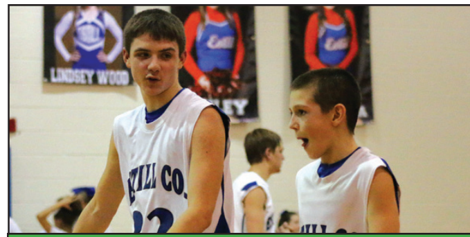
Patriots Basketball – Page 12 & 13