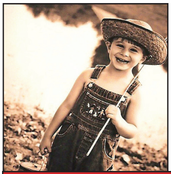
Little Sweethearts – Page 13