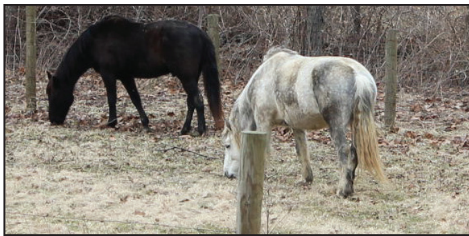
Horses Part of Treatment – Page 1,7