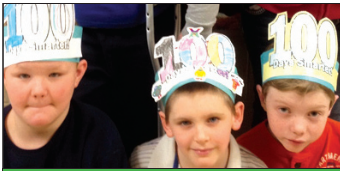
100 Days of School – Page 2