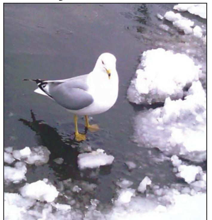
Sea gulls stopped at the parking lot of Save-A-Lot after the big snow on Monday.