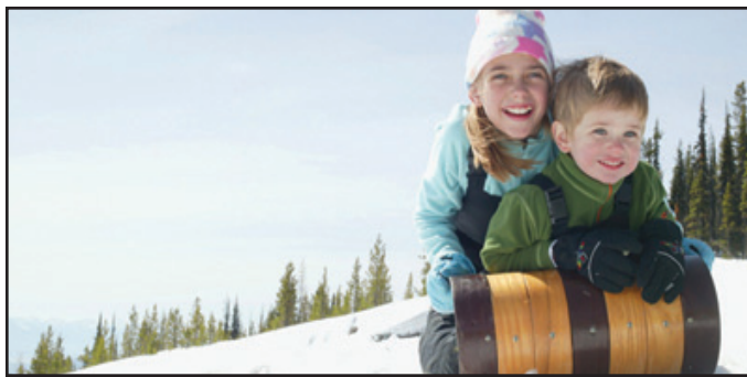
Remembering Sledding – Page 9