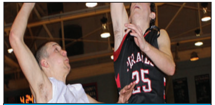
ECHS in tourney play – Page 12, 13