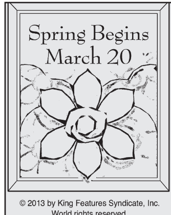
© 2013 by King Features Syndicate, Inc. World rights reserved.