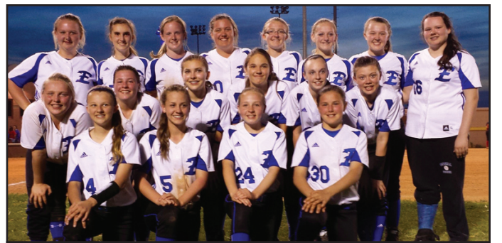
Estill Sweeps Tourney – Page 17