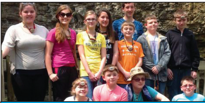
Science Olympiad Is 11th – Page 2