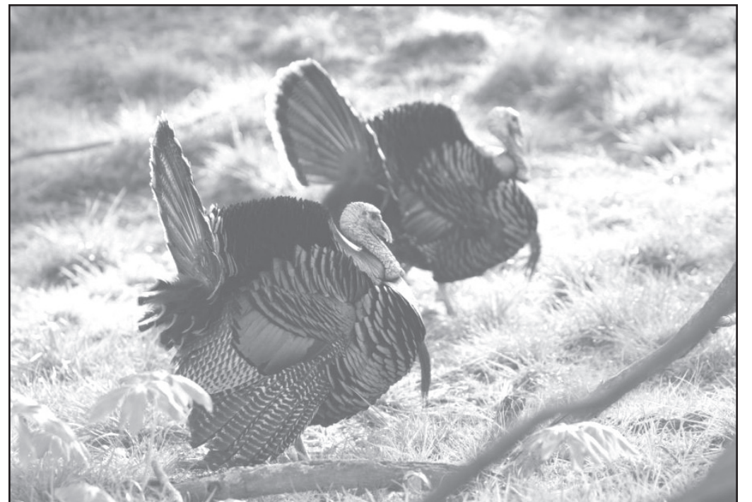
The statewide spring wild turkey season in Kentucky opened Saturday, April 12 and runs through May 4. Kentucky's wild turkey flock is estimated to number about 220,000 birds. Last spring, hunters reported taking 32,498 wild turkeys as Kentucky averaged more birds harvested per square mile (0.82) than any of the seven states bordering it.