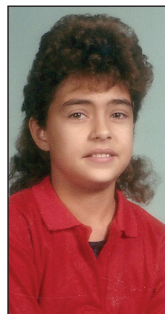
Lordy, Lordy! Look who's 40! Happy Birthday April 16th