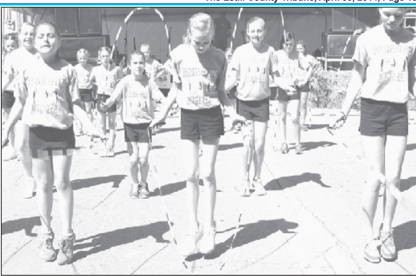
of mushroom festival after Estill County's Elite Jump Road team performed at the grandstand of the Mountain Mushroom Festival on Saturday morning.

AUTHORIZED RETAILER Programming, pricing, terms and conditions subject to change at any time. Receipt of DIRECTV programmin subject to DIRECTV Customer Agreement; copy provided at directv.com/legal and in order confirmation. © 2014 Hughes Network Systems, LLC. HughesNet is a registered trademark of Hughes Network Systems, LLC, an EchoStar company. DIRECTV and the Cyclone Design logo are trademarks of DIRECTV, LLC.