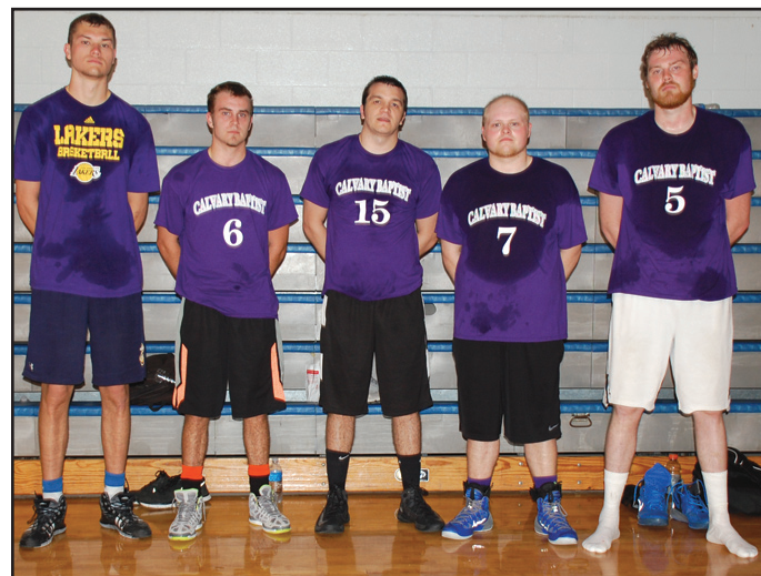
Estill County Church Basketball League 2014

Regular Season Champs Calvary Baptist (8-1)