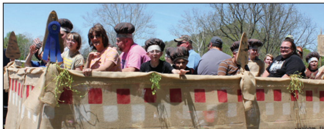
Top Photo: Thomas Baptist Church had nearly 40 people on their float in the parade. Bottom photo: This Girl Scout float in the parade was very colorful. There were several other troops in the parade.