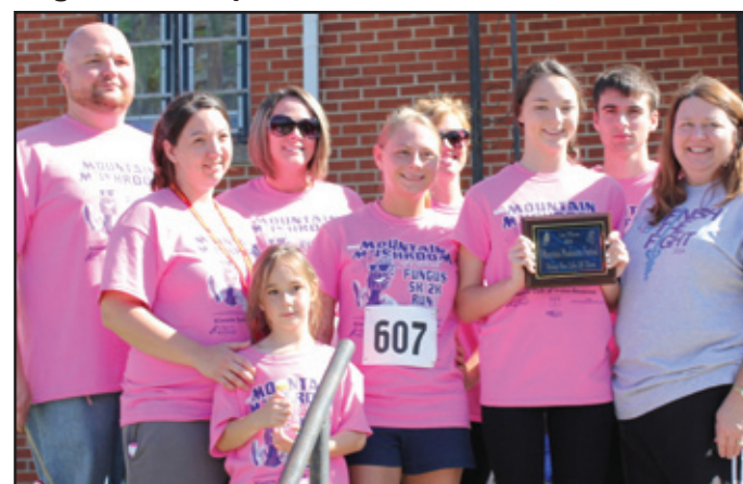
One of the teams participating in the 5K race.