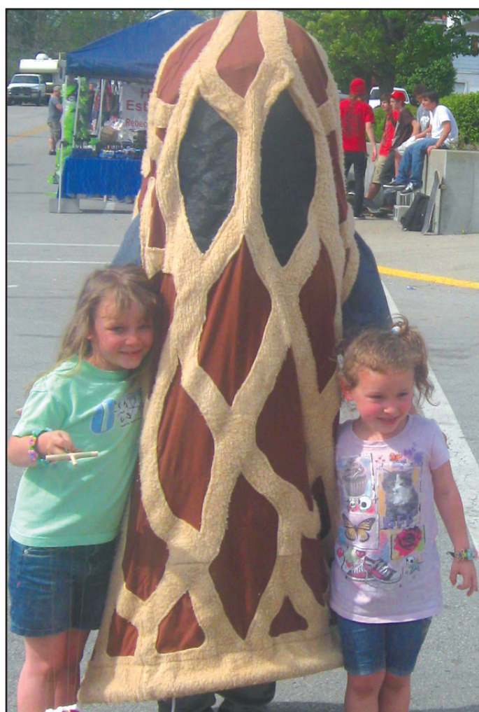
The new mascot (morel) was introduced at the festival. He gets hugs from two young ladies. A contest is forthcoming to name the mascot.