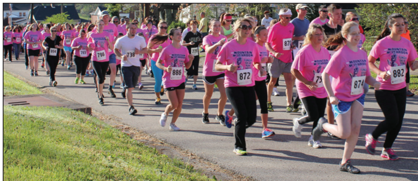
Over 300 people ran or walked Saturday morning during the Fungus 5K, which may be a record. New this year was a 2K race for youth, and teams also participated.