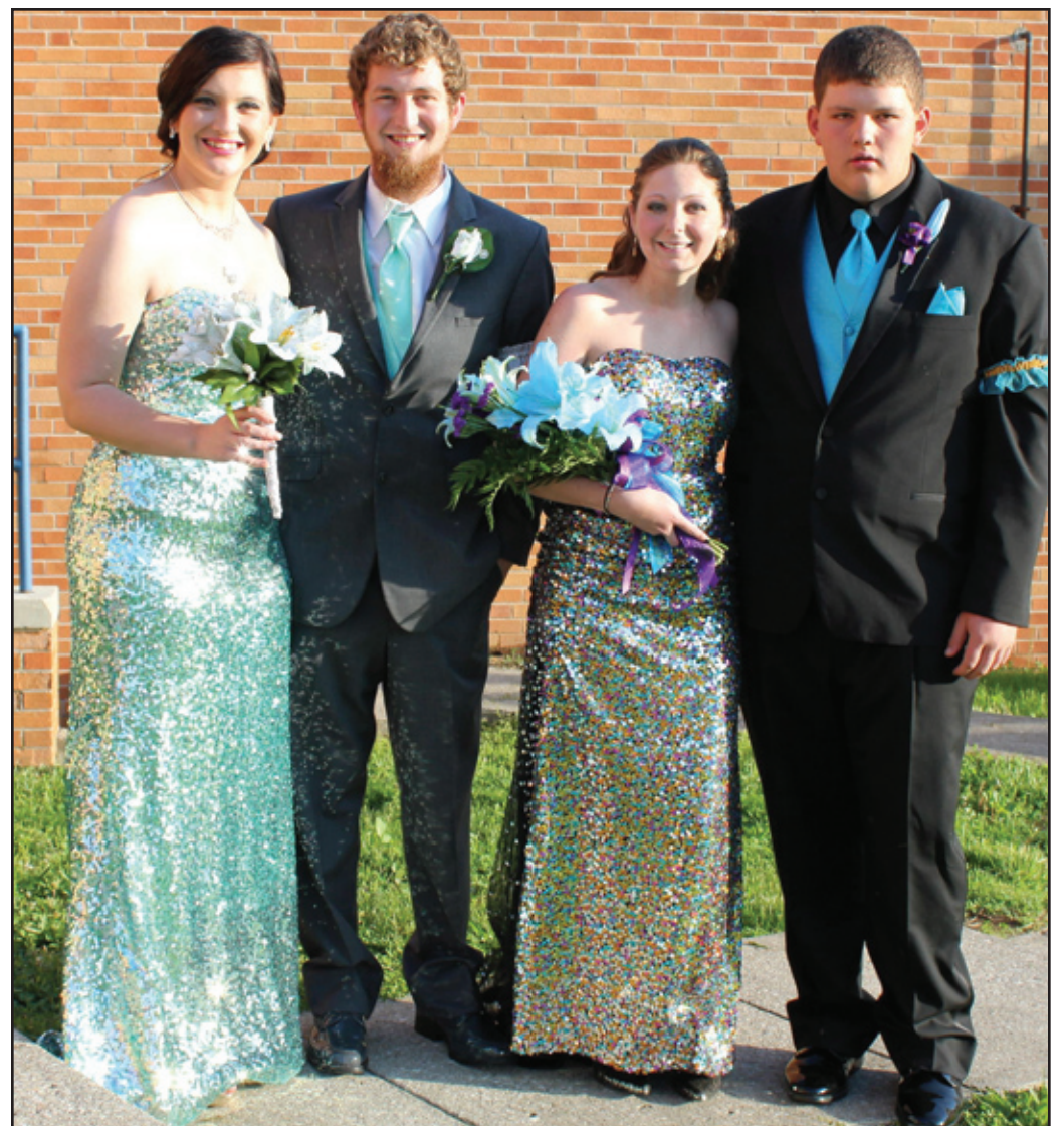
Estill High Prom 2014

Estill High held its 2014 Prom on Saturday night. A rainy morning made way for sunshine when students and their dates went to the prom. More prom photos inside this issue. Other photos will be on the Tribune Facebook page for you to download later this week.