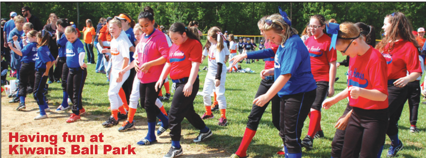
Having fun at Kiwanis Ball Park