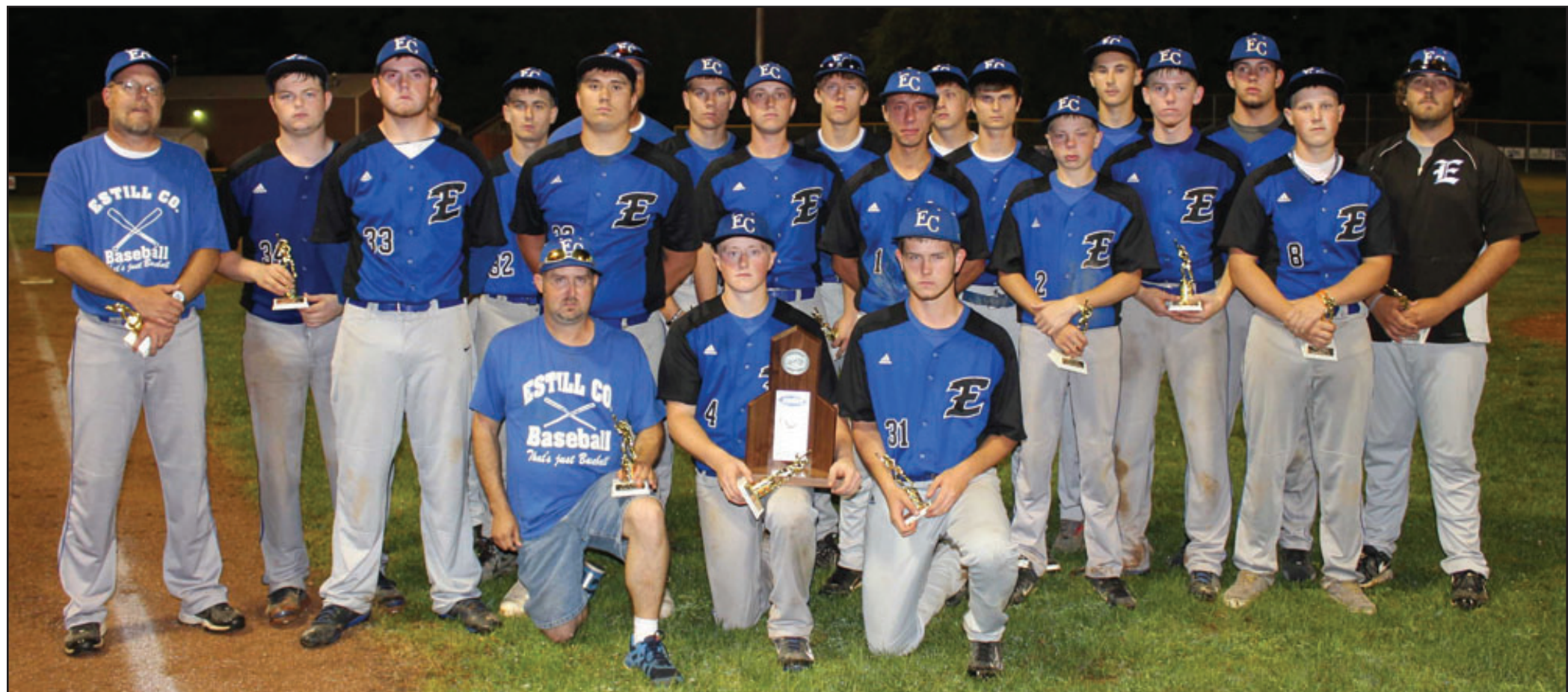
Estill County Engineers -- 2014 Runner-Up 14th Regional Tournament