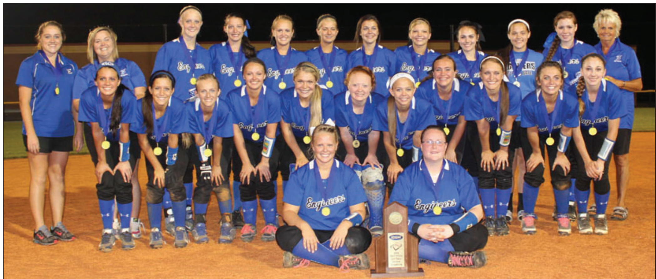
Estill County Lady Engineers -- 2014 14th Region Champions