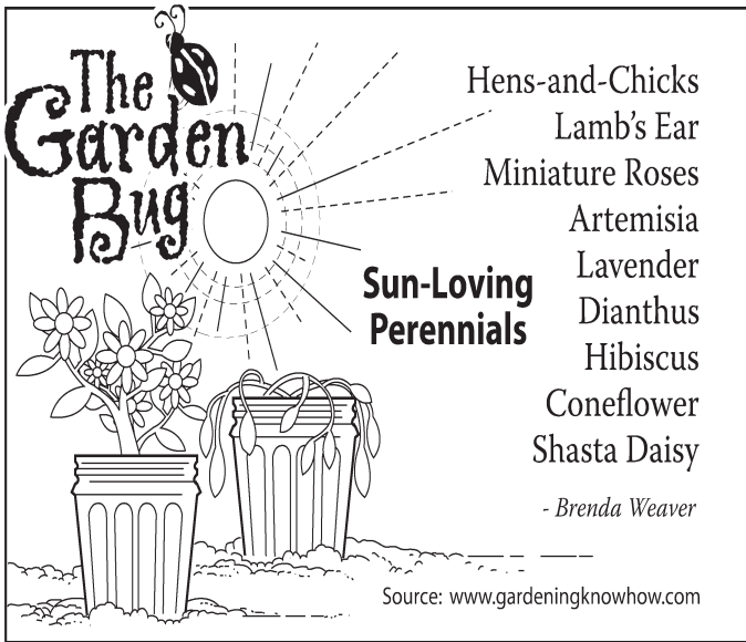
© 2014 by King Features Syndicate, Inc. World rights reserved.

Educational programs of the Cooperative Extension Service serve all people regardless of race, color, age, sex, religion, disability or national origin.