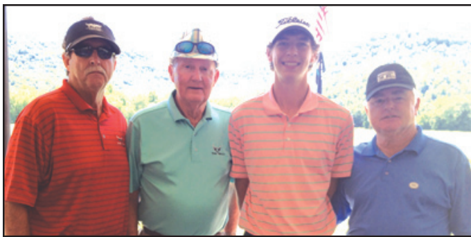
Holes for Hoops winners – Page 2