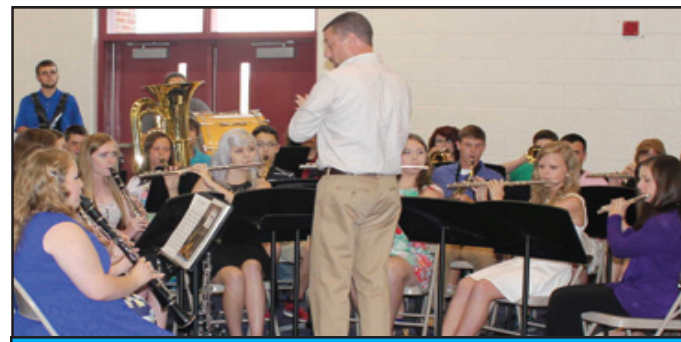
The Band Plays on – Page 15