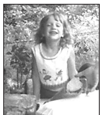
Nifty Nifty, We Can't Say Who's 50 . . .

At the airport, I saw her standing by the curb in her cowboy boots and blue dress. For just a moment, my eyes played tricks on me and she was seven years old, waving from our front porch; fourteen, waving from the band room door; nineteen, from the steps of Transylvania University; twenty-two from the window of her Nashville apartment; the truck as she drove away with her new husband; her sidewalk as we arrived at her home in Ft. Polk, Louisiana. Thirty years of waves flashed before my eyes as I slowly approached the airport's guest pick up. It dawned on me that I had been blessed with 'green lights'! GO-a loving husband, GO-a wonderful daughter and son, GO-a lifetime of happy memories. I had been given the green light to GO not just today, but everyday! I glanced up and said again, "Thank you . . . thank you Lord for cowboy boots and blue dresses . . . and a lifetime of green lights!"