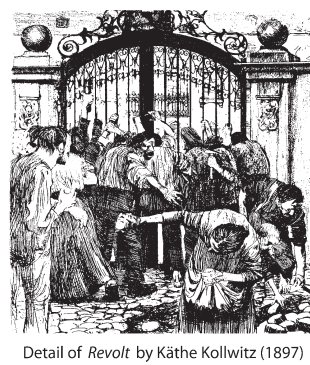
Detail of Revolt by Käthe Kollwitz (1897)