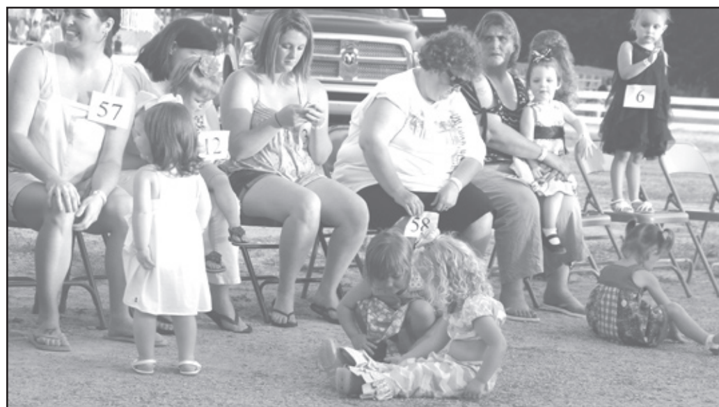
Little girls in the two year old category were more interested in playing in the dirt and making friends than participating in the baby show on Tuesday night.