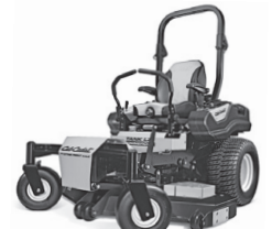
TANK™ L SERIES** COMMERCIAL ZERO-TURN RIDERS