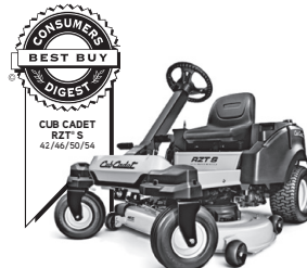
RZT S SERIES FOUR-WHEEL STEER ZERO-TURN RIDERS

SMART FACTORY FINANCING AVAILABLE! AVAILABLE ON SELECT MODELS TO QUALIFIED CUSTOMERS.