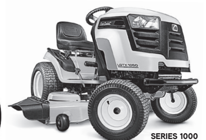
SERIES 1000 LAWN AND GARDEN TRACTORS