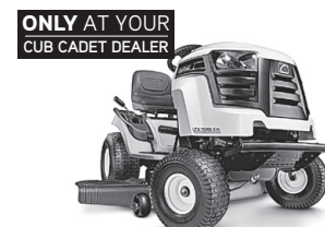
SERIES 1000 LTX KW LAWN TRACTORS