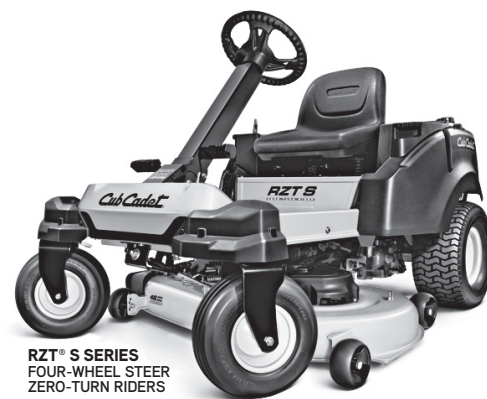
RZT S SERIES FOUR-WHEEL STEER ZERO-TURN RIDERS

SUMMER STARTS HERE ... WITH SUNSHINE AND THE SMELL OF FRESH CUT GRASS