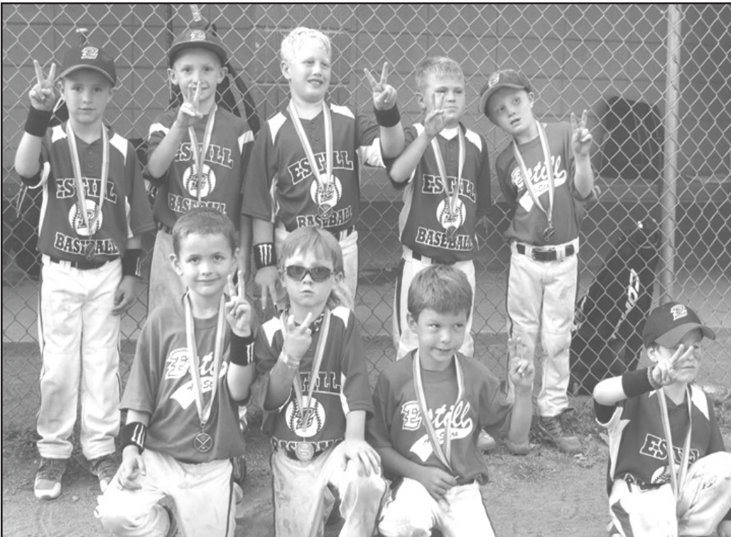
Estill's 6U was runner up at the Hazard tournament and were champions of the McKee tournament.