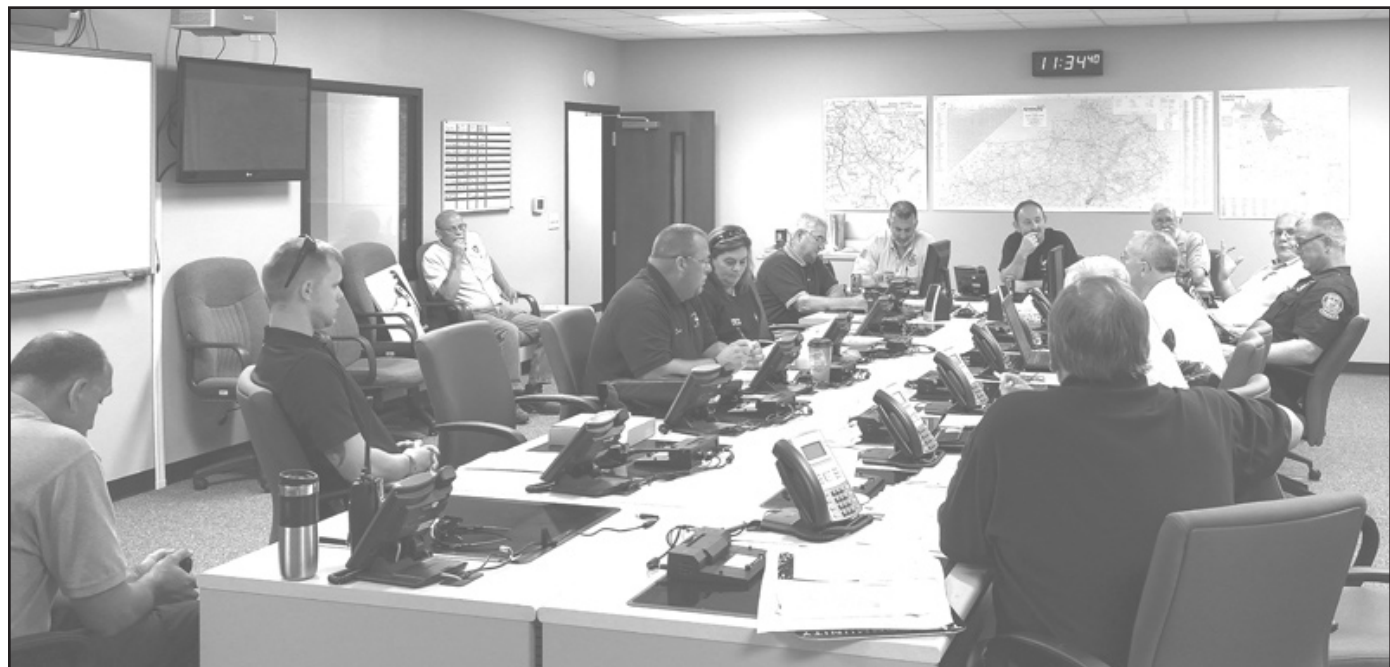
Estill County EMA/CSEPP and Fire Department hosted the Blue Grass Emergency Response meeting at the local Emergency Operations Center on Broadway in Irvine on Tuesday, July 8, 2014.

For more information contact the Estill County EMA/CSEPP office at 723-6533.