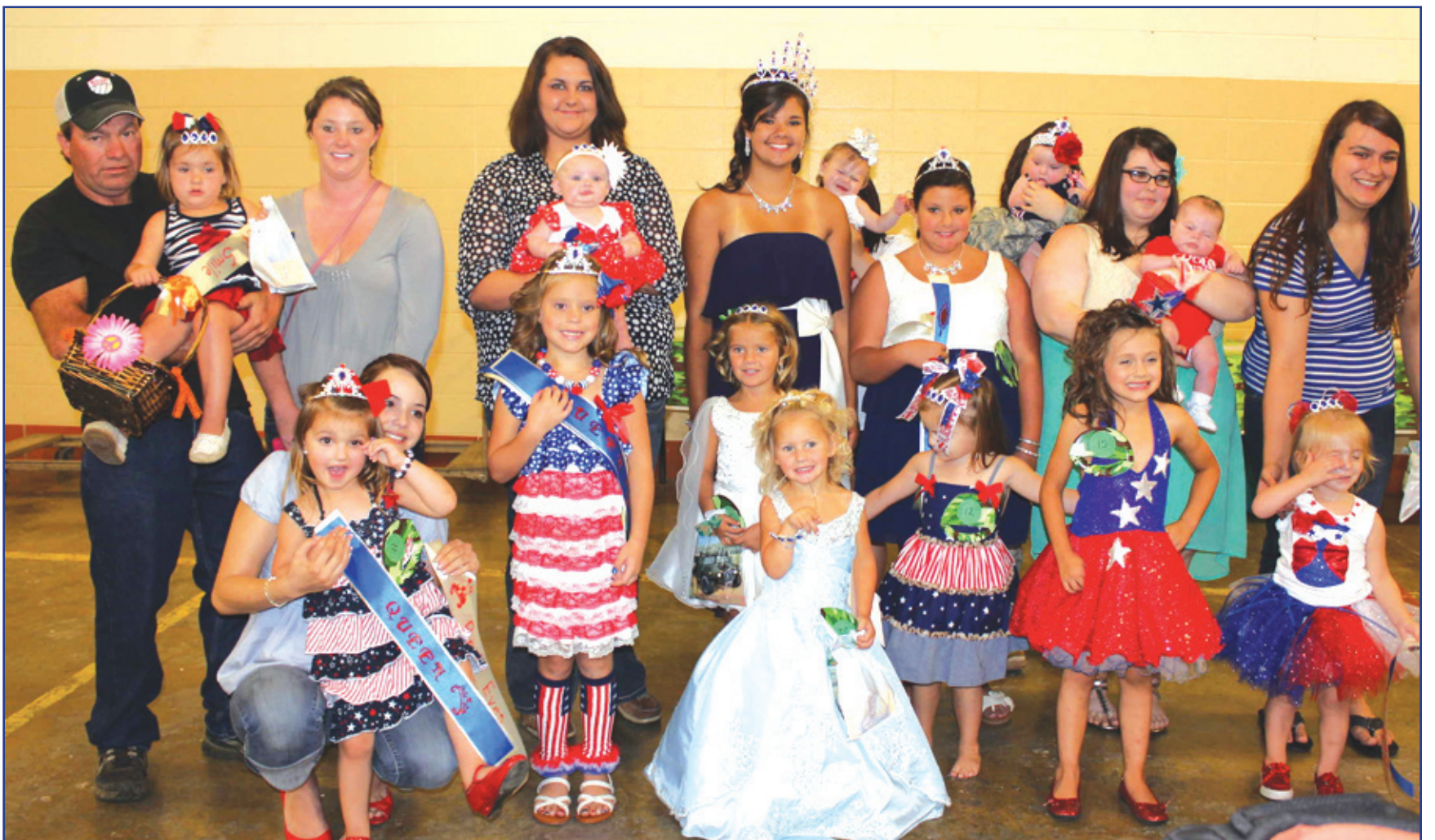
Pictured above are the winners in the Military Missions pageant held at the National Guard Armory on Saturday afternoon. Contestants competed in five classes from newborn to 18 years of age. The contestants and family members brought in over 400 items to be given to the military.