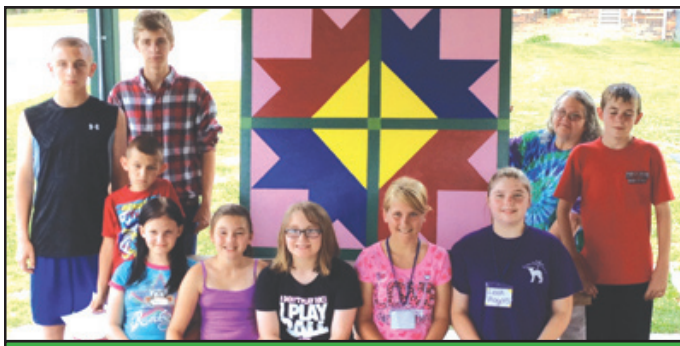
Appalachian Summer Camp – Page 15