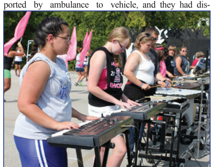
More band photos on Page 16.

Call (606) 723-5012 • Fax (606) 723-2743 • Email <News@EstillTribune.Com>