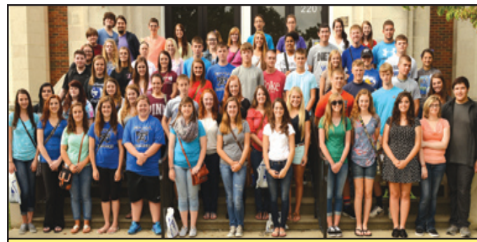
ECHS Students Visit MSU - Page 7