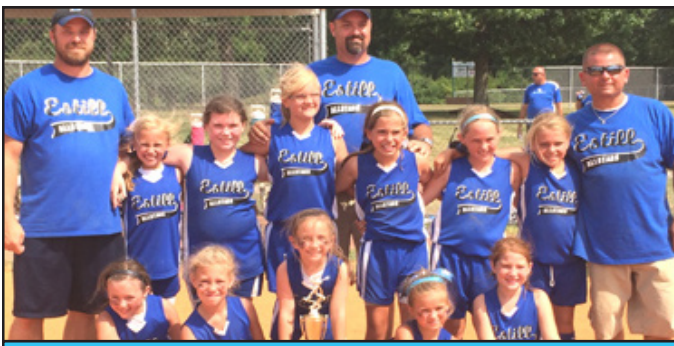
Estill 8U All-Stars Softball - Page 15