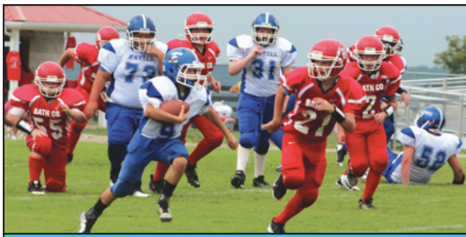
Patriots At Bath Bowls - Page 14