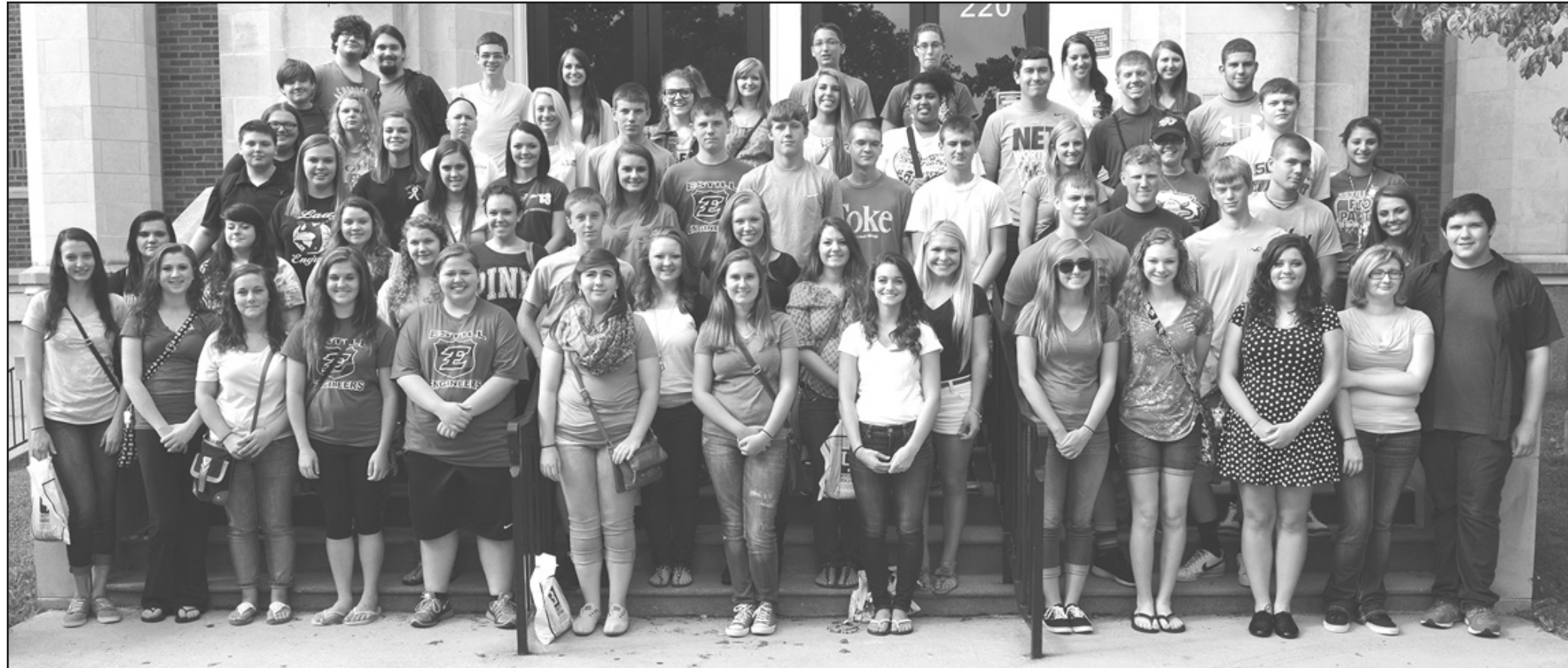
Students from Estill County High School visited the Morehead State University campus on Tuesday, August 12, 2014, as part of MSU's Early College Program. Students get to earn college credit for free or at a much reduced rate through the program.