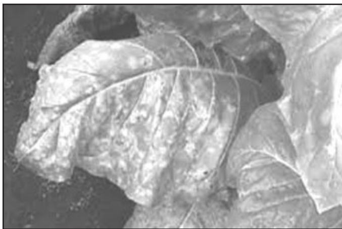
Severe Blue Mold disease in Kentucky.

Educational programs of the Cooperative Extension Service serve all people regardless of race, color, sex, religion, disability or national origin.