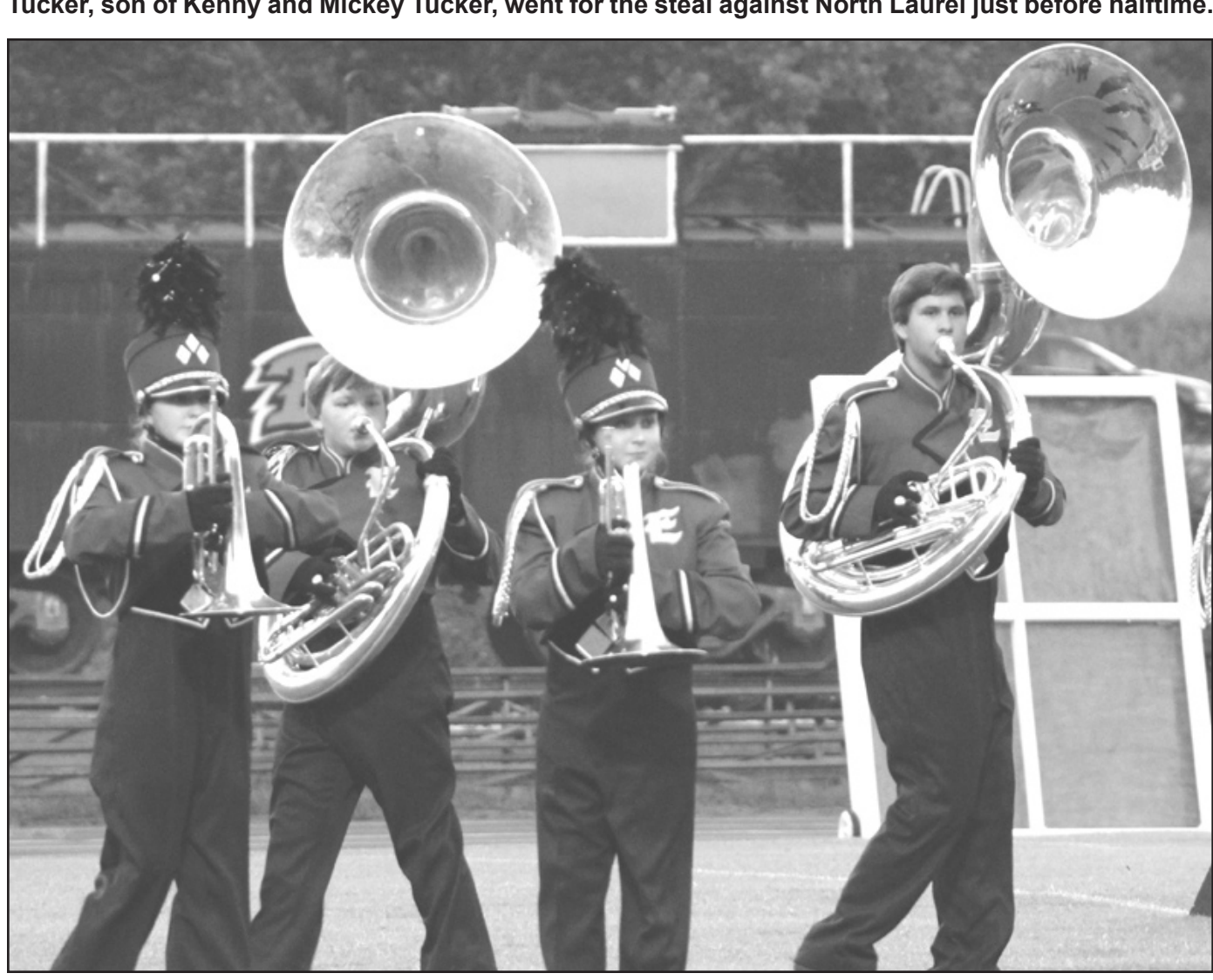
Engineers, consisting of close to sixty members, will travel to Bourbon County on September 6th for their first competition of the season.