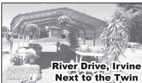
River Drive, Irvine Next to the Twin