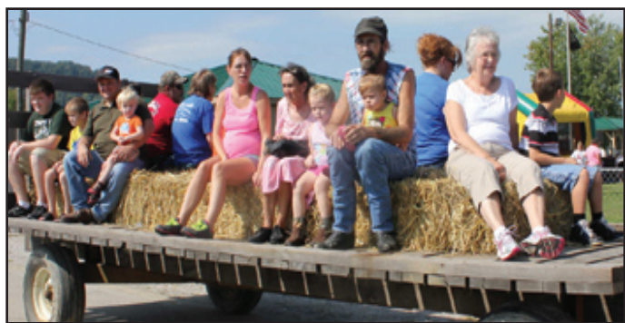
Free hayrides were given for the first time at the festival.