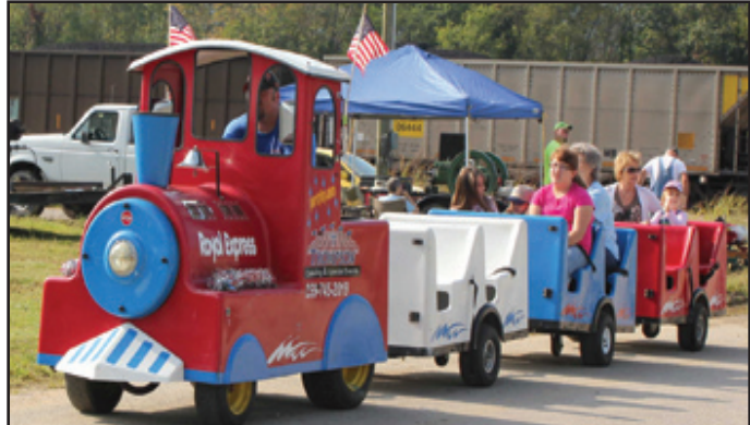
There were also free train rides again at this year's festival.