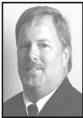
REALTOR, BROKER CRS, GRI, ABR