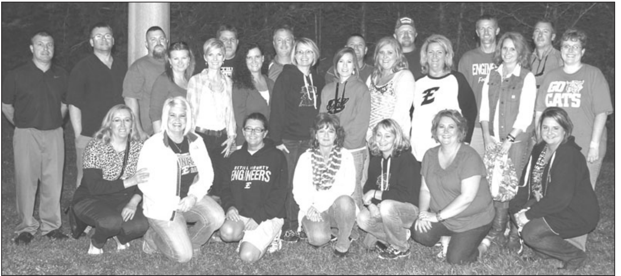
Graduates from the class of 1989 reunited during the football game between Estill and Bath County on Friday, September 19th at the Estill County High School.