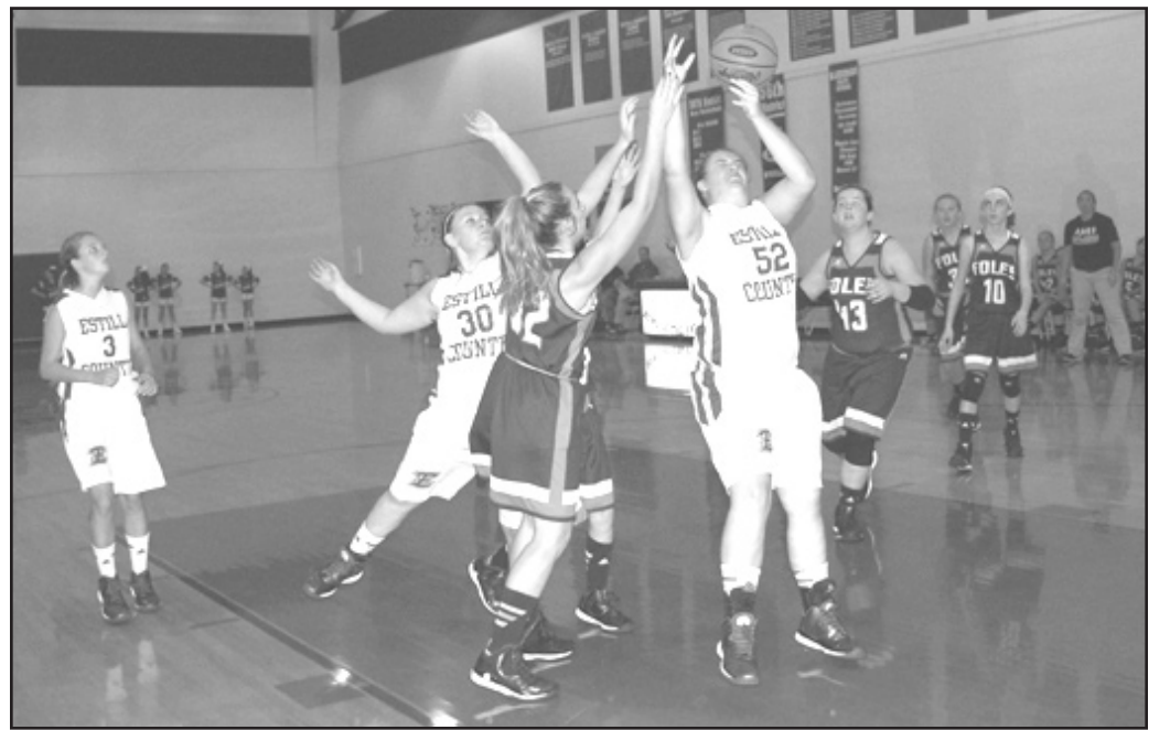
Action between the Estill Lady Patriots and Foley Middle in Irvine.