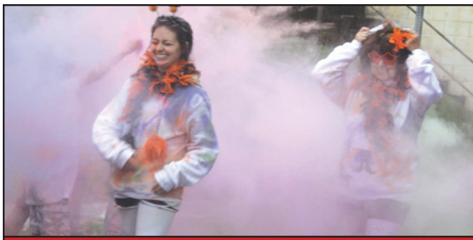
Hospice Color 5K- Page 2