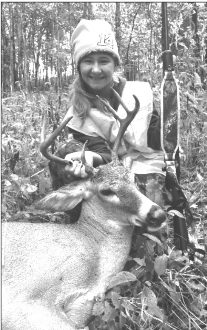
Needs West with a nice buck!

Until next week, get out and enjoy God's creation!