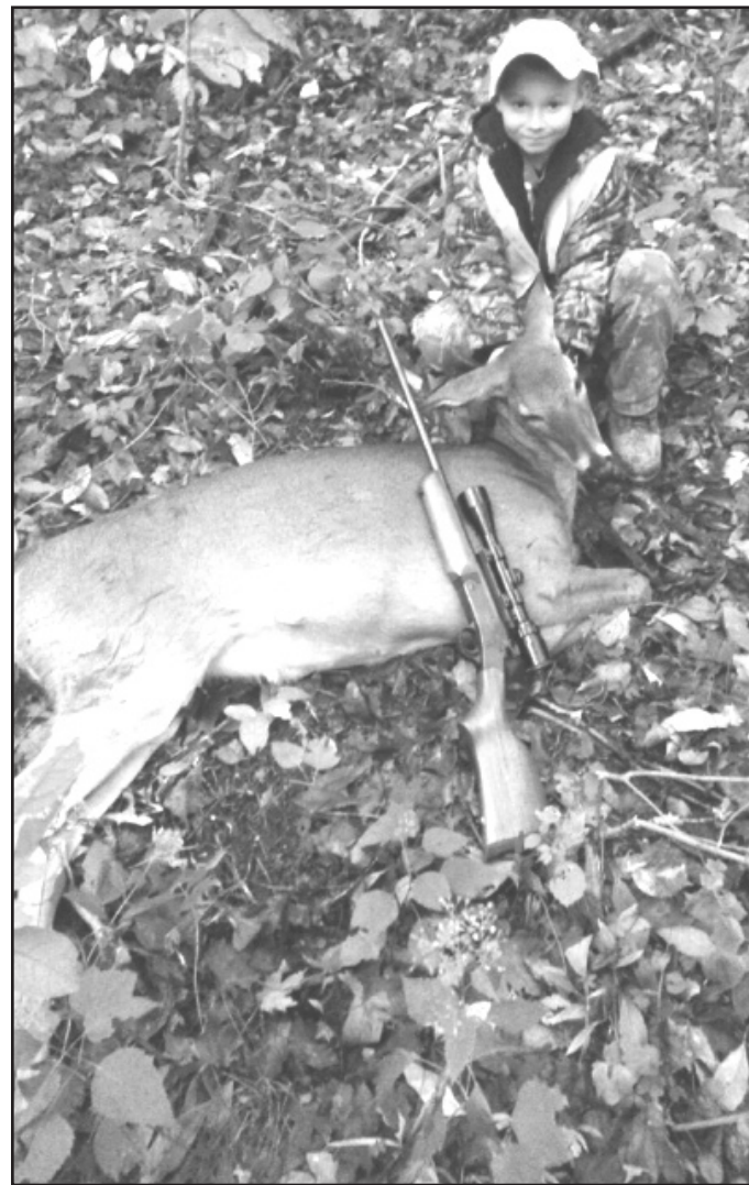
Kyle Conrad with first deer!